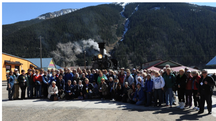
Group picture of members of the SWS and SCS in Silverton, Colorado, during the narrow gauge train tour.