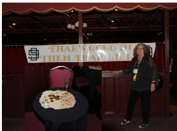
A sample of the decorations provided by the Monterey Bay Chapter for the Friday night gala — "ancient" sectional chart treasure maps, chocolate filled coins, western-themed confetti and a banner declaring "Thar's gold in them thar girls!"